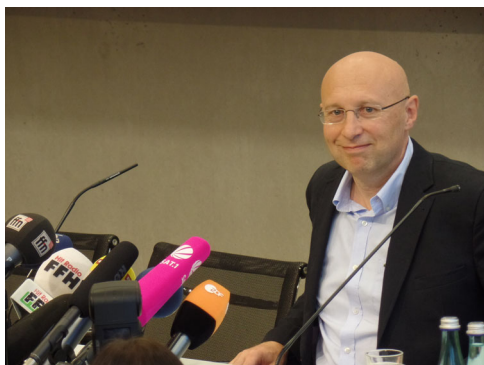
Prof. Hell answering questions from journalists on 08 October 2014 on Nobel Prize