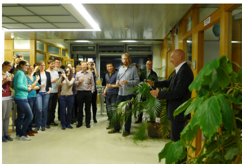
Prof. Hell opening Champagne with students to celebrate his Nobel Prize

Prof. Hell: As long as they work in my laboratory, they work on problems that I prefer and prioritize. However, I strongly encourage them to come up with their scientific vision and set up their own independent laboratory.