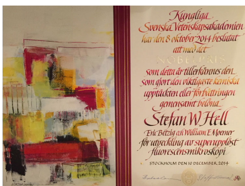
Prof. Hell's Nobel Award Certificate