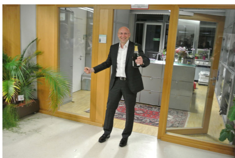
Prof. Hell opening Champagne to celebrate his Nobel Prize