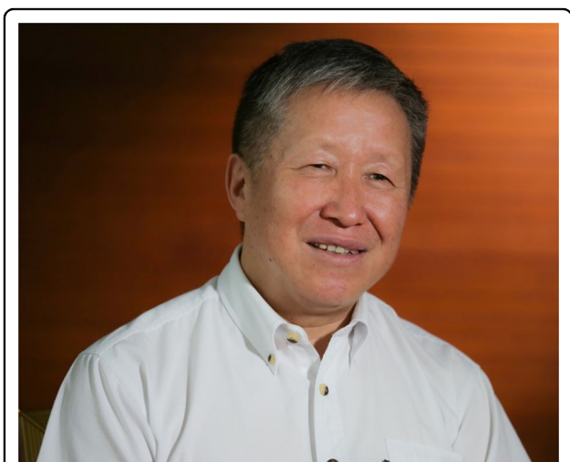
Fig. 1 When LSA was founded, I was a Vice Minister of Science and Technology of the People's Republic of China, my long experience and insight with international science collaboration made me very much desire a journal to make the exchange of scientific knowledge freely exchanged and available to all, regardless of geography. That's my main motivation to found LSA .

Sixth, in 2013, the United Nations Educational, Scientific and Cultural Organization (UNESCO) proclaimed 2015 as the International Year of Light (IYL), and 2 years after that, 16 th May was proclaimed as the International Day of Light (IDL). With the greatest pleasure and honor, LSA was invited as one of the Founding Partners of IYL and IDL . Since then, LSA has been taking on duties to promote optics and photonics. At each International Day of Light