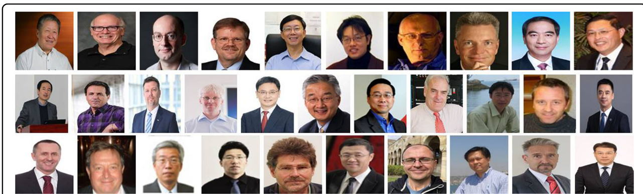
Fig. 2 Founding Editorial Board Members of Light: Science & Applications .