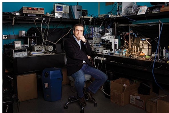
Prof. Aydogan Ozcan in the lab.

This deep learning-enabled image transformation between holography and bright-field microscopy replaces the need to mechanically scan a volumetric sample, as it benefits from the digital wave-propagation framework of holography to virtually scan through the sample, where each one of these digitally propagated fields are transformed into bright-field microscopy equivalent images, exhibiting the spatial and color contrast as well as the DOF expected from an incoherent microscope.