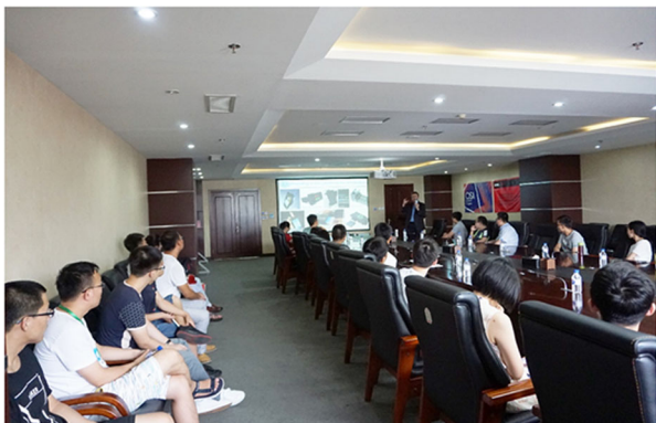
Prof Aydogan Ozcan giving a lecture at CIOMP.

applications from Chinese universities. The students have an amazing package. They come with an excellent research background, strong publications and are always eager to work hard and learn deeper. Also I personally find Chinese students provide an excellent fit to my lab and its dynamic style—they are very collegial, respectful, and hardworking.