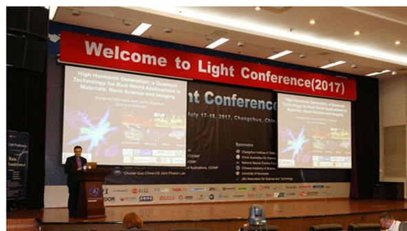
Prof Ozcan presenting at 2017 Light Conference.

data than normally required. Using standard image reconstruction methods employed in OCT, under-sampled spectral data, where some of the spectral measurements are omitted, result in severe spatial artifacts in the reconstructed images, obscuring 3D information and structural details of the sample to be visualized. In our new approach, we trained a neural network using deep learning to rapidly reconstruct 3D images of tissue samples with much less spectral data than normally acquired in a typical OCT system, successfully removing the spatial artifacts observed in standard image reconstruction methods. The efficacy and robustness of this new method was demonstrated by imaging various human and mouse tissue samples using threefold less spectral data captured by a state-of-the-art swept-source OCT system. Running on graphics processing units (GPUs), the neural network successfully eliminated severe spatial artifacts due to undersampling and omission of most spectral data points in less than 1 ms for an OCT image that is composed of 512 depth scans (A-lines). These results that we have recently published in LSA highlight the transformative potential of this neural network-based OCT image reconstruction framework, which can be easily integrated with various spectral domain OCT systems, to improve their 3D imaging speed without sacrificing resolution or signal-to-noise of the reconstructed images.