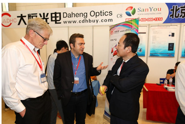
Prof. Ozcan communicating with Prof. Olav Solgaard (left) and Prof. Tianhong Cui (right) at 2017 Light Conference in Changchun.

In one of our latest papers published in LSA 11 , we also report the design of diffractive surfaces to all-optically perform arbitrary complex-valued linear transformations between an input and output field-of-view. Stated differently, we demonstrated in this recent work the universal approximation capability of diffractive networks for all-optically synthesizing any arbitrarily selected linear transformation with independent phase and amplitude channels. Our methods and conclusions in this recent LSA work can be broadly applied to any part of the electromagnetic spectrum to design all-optical processors using spatially engineered diffractive surfaces to universally perform an arbitrary complex-valued linear transformation. Therefore, these results have wide implications and can be used to design and investigate various coherent optical processors formed by diffractive surfaces such as metamaterials, plasmonic or dielectric-based metasurfaces, as well as flat optics-based designer surfaces that can form information processing networks to execute a desired computational