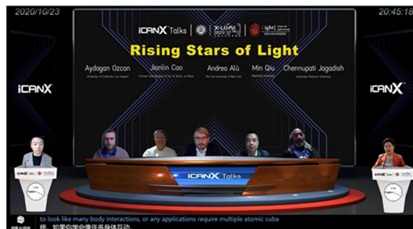
2020 Rising Stars of Light online.

Researchers do not work for awards—we are motivated by our curiosity and our passion for “change”—making the world better and advancing our understanding of the universe through the impact of our science and engineering. Having said this, these awards can sometime motivate researchers to continue in their careers, and help them accelerate their progress, reminding them of the importance of their research and broader impact. In this sense, I find the Rising Stars awards very important and timely. 2020 Rising Stars of Light online.