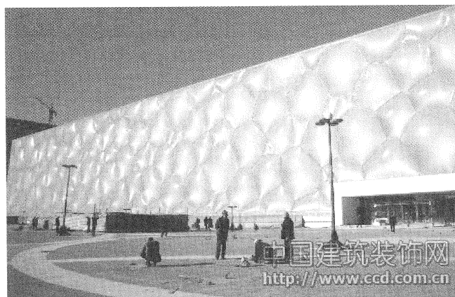
Fig. 3. Outdoor isolation and light reflection effect with ETFE membrane

building and is designed to absorb natural light with the membrane structure to regulate the light and temperature inside to achieve the objective of energy conservation and environmental protection. However, just by virtue of the smooth membrane, it is troublesome to turn it into a green house, let alone regulating the light and the temperature. The round coating points are the secrets to solve this problem. They are like small sunshades and play roles in isolating and reflecting light and block the dazzling light and excess heat outside (Fig. 3). In the north, the sunlight load is small, for this reason, the density of the coating points is small and the northern space feels clear. However, in the west and east, as the incoming sunlight is intense and the coating points are denser. In order to keep the indoor environment cool when the sunlight is intense or it is exposed to the intensive heat of the afternoon sun, the small sunshades must be distributed accurately.